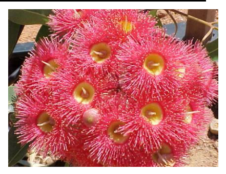
Floral Emblem Eucalyptus erythronema (Red Flowering Mallee)